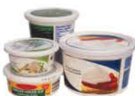
HDPE Tubs and Lids