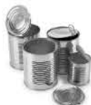
Steel food and beverage cans